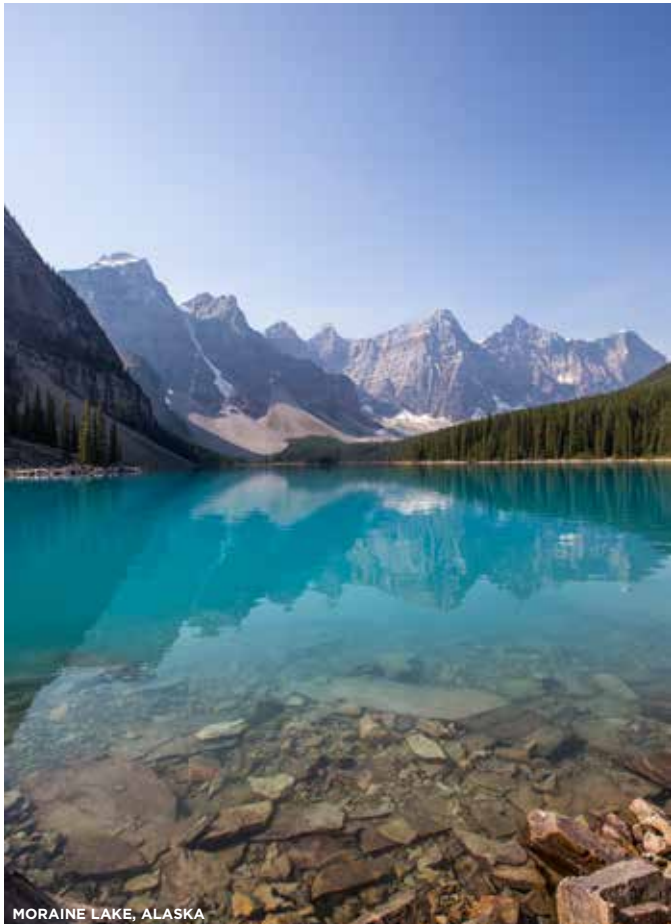
MORaine LAKE, ALASKA